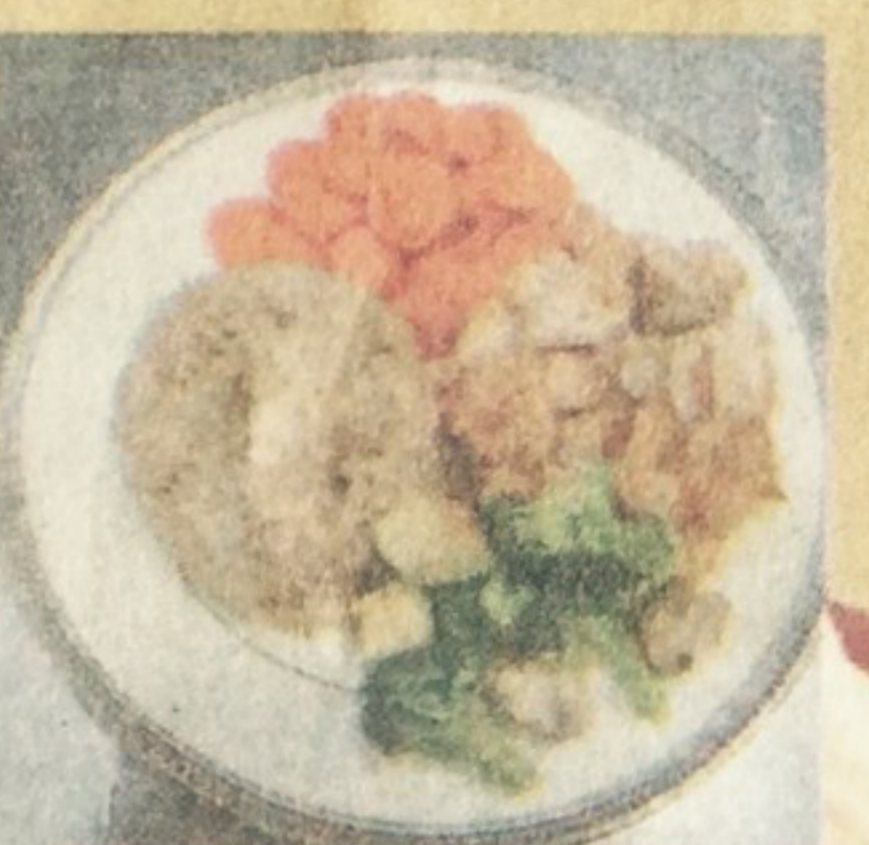
Hibachi Chicken and Shrimp