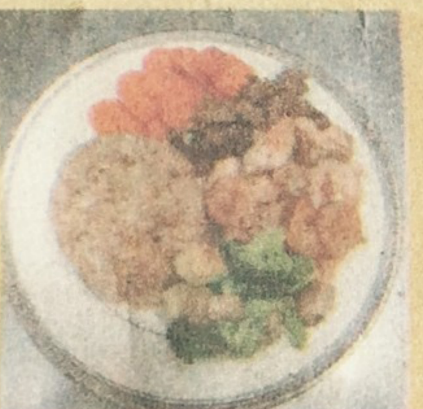
Hibachi Steak, Shrimp, and Chicken