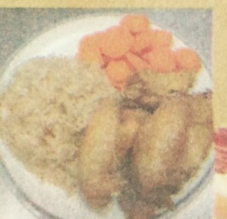
Chicken Wings with Hibachi Fried Rice