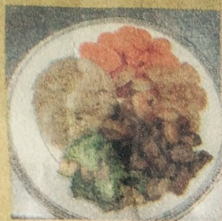
Hibachi Steak and Shrimp